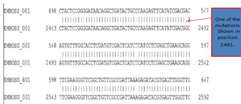
Fig. 2. A schematic representation of a mutation in 23S rRNA genes in online clustalW2 software. One of the mutations is shown at position 2491.

(Fig. 2). Also, the measurement of MIC in all M. pneumoniae -positive samples using the broth micro-dilution method, indicated that all specimens were sensitive to Clarithromycin, and no ML resistance was reported (Table 2).