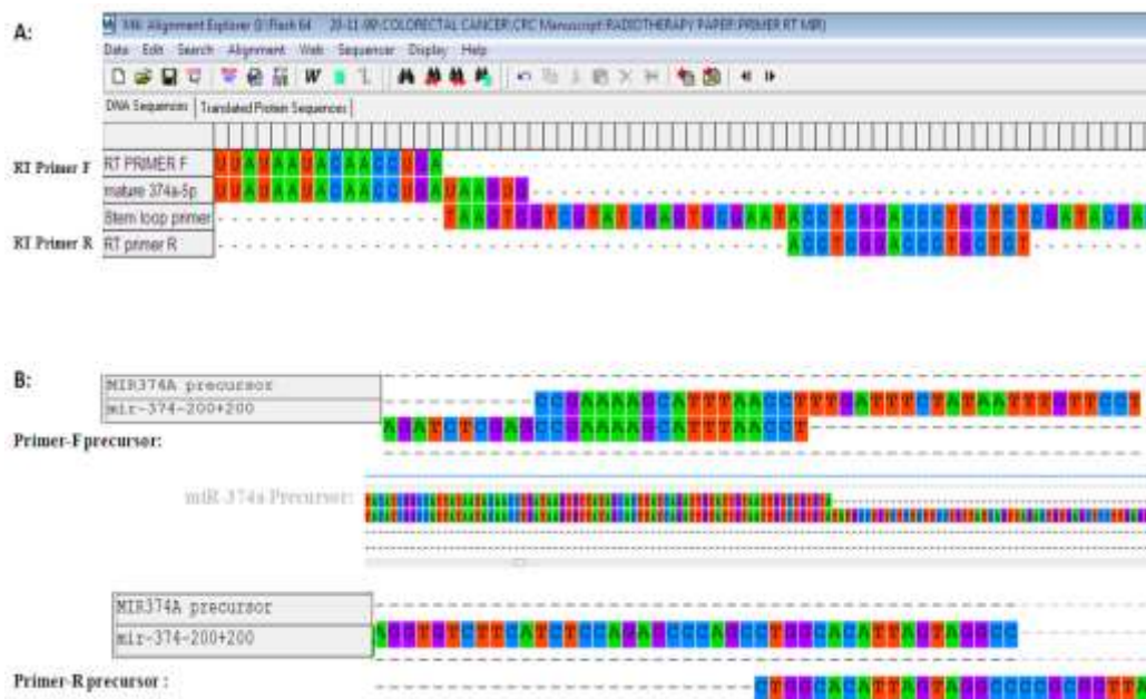
Fig. 1. Schematic overview of primers used to amplify the miR-374 mature and precursor sequences. RT primers F and R (A) and precursor primers F and R (B).

magnification of 400x, then averaged the results.