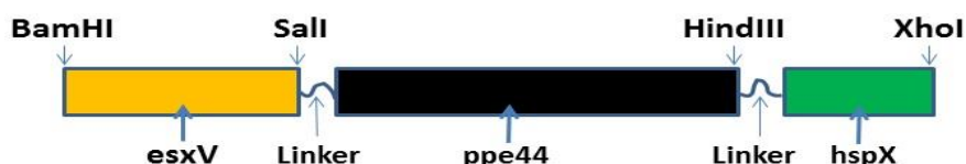
Fig. 1. Schematic illustration of synthetic construct. The AEAAAKEA linkers and different enzyme cutting sites were placed between the selected genes.