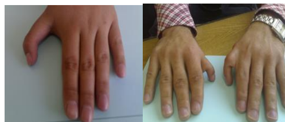
Fig. 1. Hands of patients with Holt-Oram or heart-hand syndrome. Both thumbs are abnormally short and curved.