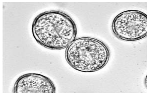
Fig. 2. Light microscopy image of Platanus orientalis grains (X100).

The pollen grains extracts containing excipients were evaluated by the normal stability test. Before the test each mixture was incubated at room temperature (24 ± 2 °C) for 24 h to complete the emulsification process (29).